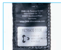
Lot Specific Retrace Code for traceability and certification